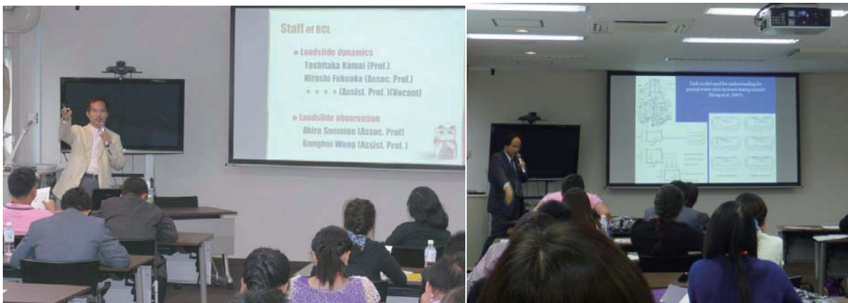
(Above) During the lecture