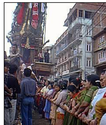
Fig 4: Chariot pulling festival in Lalitpur, Nepal

Town watching uses observation as a tool in the process of raising the level of awareness of participants about their surrounding (Ogawa et.al, 2005). Before drawing an analogy between ritual event and town watching it is important to explain the ritual event in more detail. The voluntary participation of residents in walking around the city along with a mobile chariot is the major component of ritual event named Machhendranath. The event is stopped at several areas where participants from respective neighborhoods gather to pay homage to the ritual chariot.