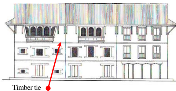
Fig 3: Symmetric residences with timber ties on wall

Many studies have shown that traditional construction methods are likely to outperform their modern counterparts in regards to earthquake vulnerability. Several details and design methods have been developed over years to deal with earthquakes in traditional buildings. A fair level of earthquake resistance is derived from symmetric plan configuration, symmetry in positioning of openings which helps reduce torsion during earthquakes (Fig. 3). The residential building structure has a central spine wall parallel to the exterior long wall and the sidewalls. The layout of floor joists and continuous wall tie or plate and the way they are connected to the wall effectively distribute the stresses over the whole building. The brittle failure and collapse through mass action associated with heavy brick wall in mud mortar, which must have been observed by the builders early on, appears to have led the builders to use timber ring ties held tight by tightening wedges. This has contributed in adding shear strength to walls on the one hand and on the other effectively split the brickwork into several masses, both aspects reducing the vulnerability of brickwork to earthquakes.