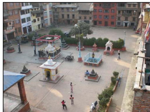
Fig 2: Open space around residential accommodation of a neighborhood in Lalitpur.

The open spaces are often named according to their function; for example, courtyards of monasteries are called " bahals " and " bahils ". There are some special public land belonging to various caste groups of the community or to temples and monasteries. They are called " guthi " land, the product from them are used during festivals or funerals for holding community feasts and for maintaining temples and monasteries. Besides, traditional compact settlement planning with settlement boundaries helped to preserve agricultural land thereby protecting primary occupational base of the local people. The traditional city dwellers were self sustained in food products which helped them to survive in the event of natural disaster such as earthquake for a longer period without assistance from other organizations.